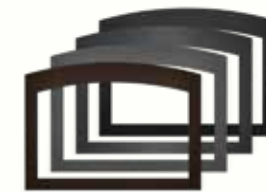
Small Arched 4-Sided Faceplates Available in 4 finishes* For use with the 3-sided backerplates