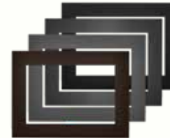
Large 4-Sided Faceplates Available in 4 finishes* For use with the 4-sided backerplate