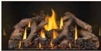
Premium Split Oak Logset (included)