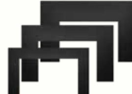
3-Sided Backerplates Available in black Available in Small, Medium & Large