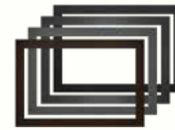
Small 4-Sided Faceplates Available in 4 finishes* For use with the 3 or 4-sided backerplates