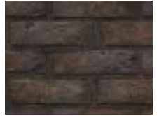
Newport™ Standard Brick Panels (optional)