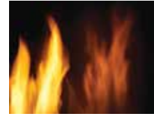
MIRRO-FLAME™ Porcelain Reflective Radiant Panels (optional)