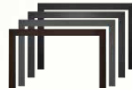
Small 3-Sided Faceplates Available in 4 finishes* For use with the 3-sided backerplates