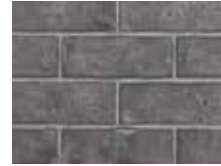
Westminster™ Brick Panels (optional)