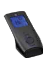
Remote Control (included)