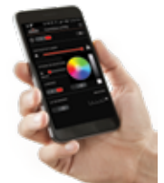
eFIRE Enabled With App (included)