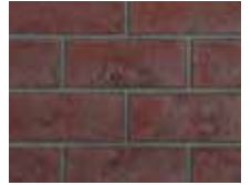
Old Town Red™ Brick Panels (optional)