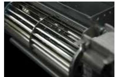
Blower Kit (included)