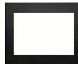
4-Sided Backerplate Available in Large