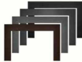
Large 3-Sided Faceplates Available in 4 finishes* For use with the 3-sided backerplates